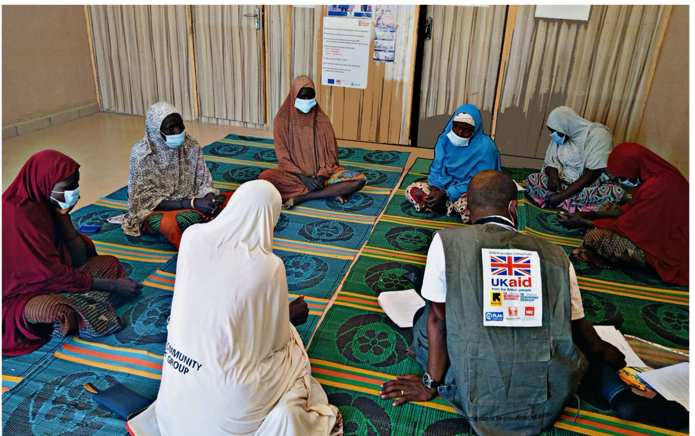
Figure 2: AAP community consultation with women in Muna Camp conducted by TWB and DRC staff

This qualitative study was funded by the Foreign, Commonwealth and Development Office (FCDO) through the ProSPINE+ Consortium. TWB partnered with Norwegian Refugee Council (NRC), International Rescue Committee (IRC), Plan International, and Danish Refugee Council (DRC) to conduct a qualitative study with 377 conflict-affected adults (excluding children and adolescents) living in camps and host communities and 28 humanitarian staff between December 2020 and March 2021. Those staff specialized in protection; child protection; gender-based violence; housing, land, and property; and camp coordination and camp management. The research locations were Bakassi Camp, Muna Garage Camp (Figure 2), Farm Centre Camp, Gubio Camp, Sulumbri (Kori Camp), Gwange host community, Stadium Camp, and Bulabulin Ngarnam host community in Maiduguri and Jere.