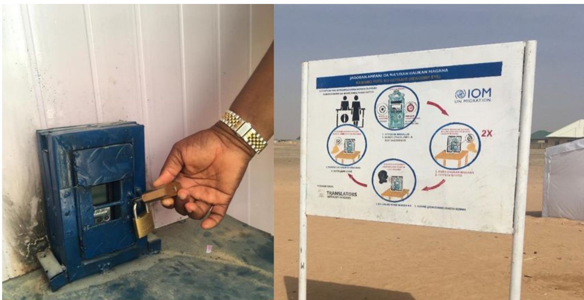
Figure 3: IOM is using voice recorders as a community feedback mechanism in camps for internally displaced people. People can record their comments in their own language inside a private booth. TWB then transcribes the feedback and translates it into English for analysis and follow up. This makes the CFM mechanism more accessible to speakers of minority languages – not just English or Hausa.